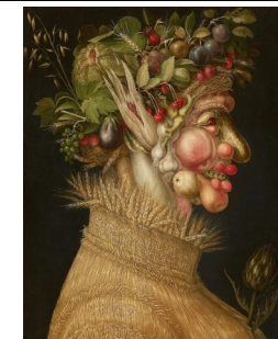
Arcimboldo: Printemps et Ete