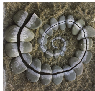
Goldsworthy: Nature Art